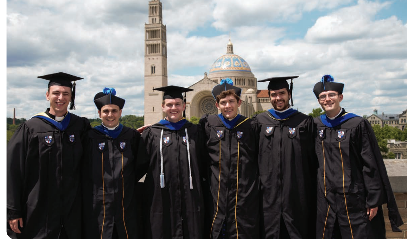
In May, three Basselin students received their Ph.B. degrees, and three received their Ph.L. degrees. Congratulations to our scholars!